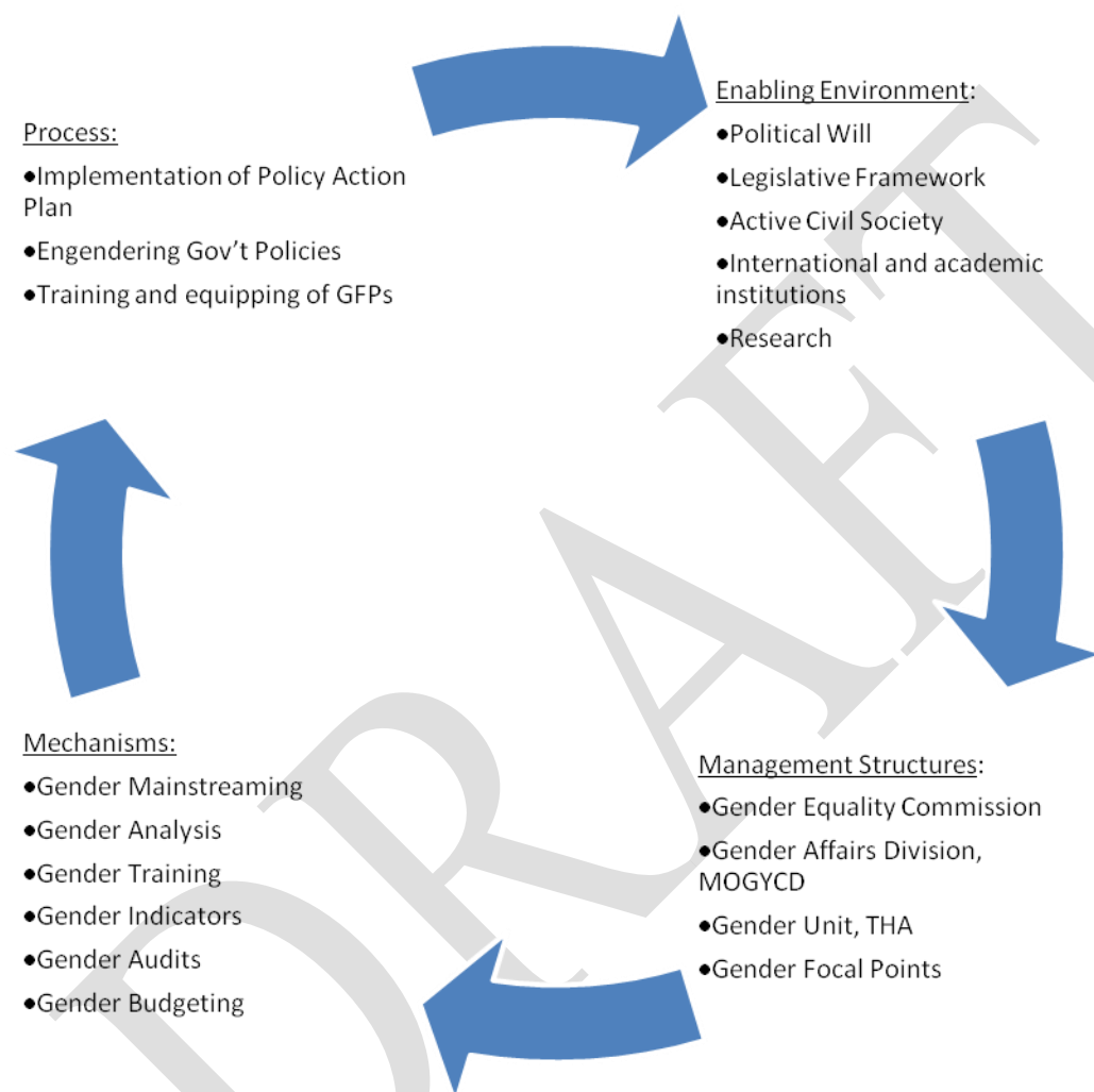
Gender Management System (GMS)